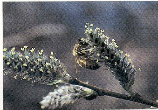
Figure 19B. Willow