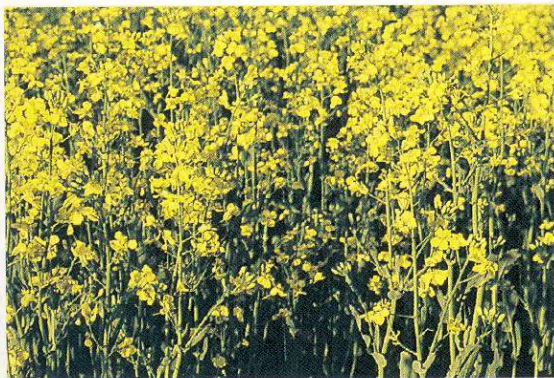
Figure 19C. Canola