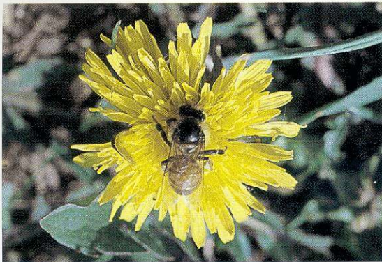
Figure 19A. Dandelion

Plants considered a major nectar source in one region may be only a minor source in others. Yearly variations may also cause minor honey plants to occasionally yield heavily or major plants to yield poorly. Again, the beekeeper must become familiar with the peculiarities of his or her own region through observation of flowering plants and dates, and weather and scale colony records.