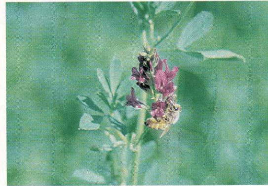
Figure 19D. Alfalfa

Major nectar plants include the following: